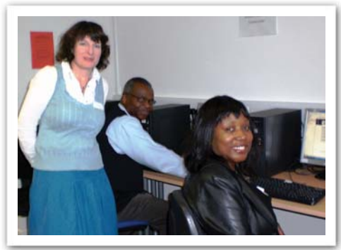
Trying out the websites