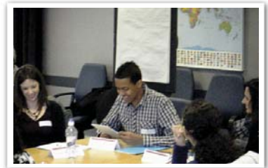
Poetry at the 'Growing the Roots' event