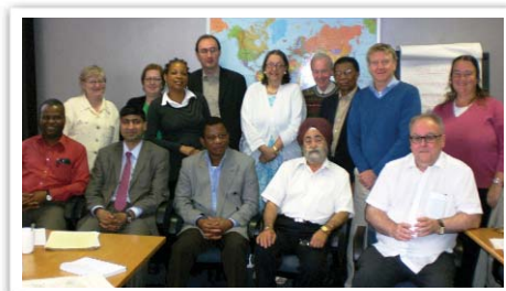
ECN Steering Group Away Event