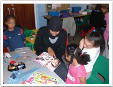
Holiday Play Scheme on Green Man Estate

Our work has been selected as a regional case study of good practice to be included in published research into the involvement of the VCS in development of the Children's Workforce.