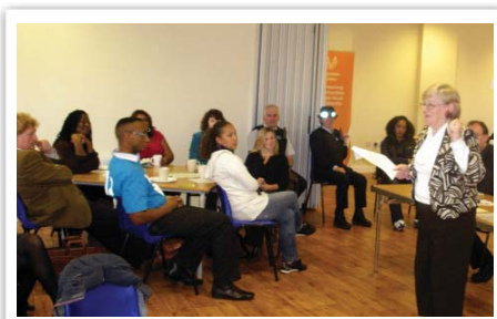
Greenford, Northolt and Perivale Consultation