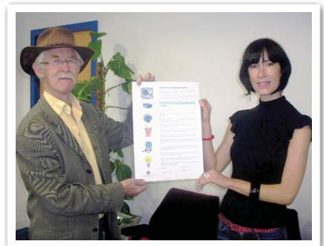
Launch of the ECN Environmental Charter