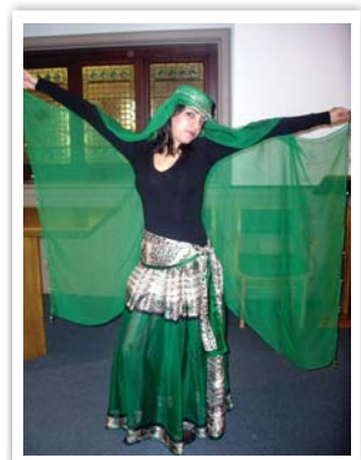
Iranian Dancer at ECN Conference