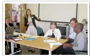
DC - Disability Panel